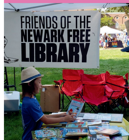
A young reader browses her choices at our Community Day book giveaway.

Newark participants were estimated to have read more than 200,000 minutes this summer!!