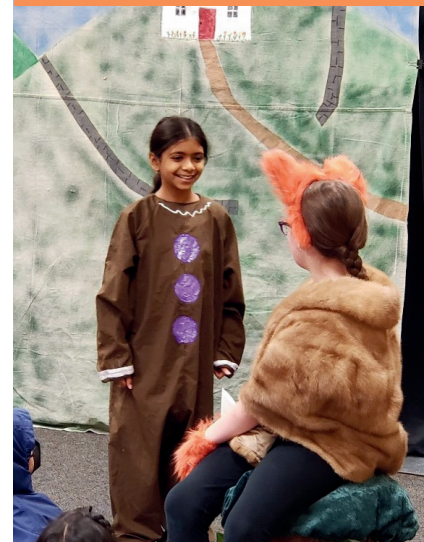
At The Gingerbread Girl, one of the Wilmington Drama League's Pillow Plays, sponsored by the Friends, spectators cozied up with a pillow to enjoy the show.