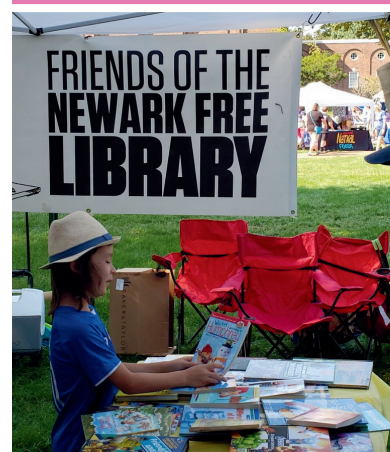
A young reader browses her choices at our Community Day book giveaway.

Reading Challenge participants read for more than 200,000 minutes this summer!!